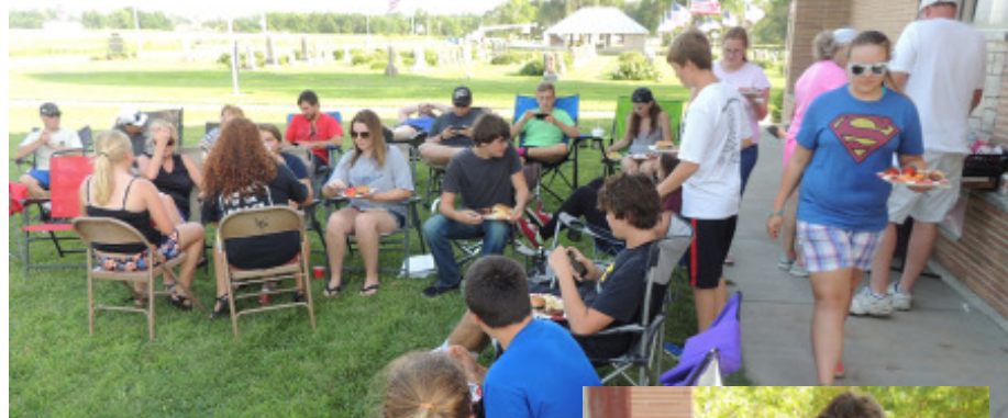
Trinity Lutheran Youth enjoyed a BBQ & both regular and water balloon volleyball on July 5 (you can just see the balloon in the air in the photo below). The event closed with taking down the cemetery flags as a service project. More photos are in the Picture Gallery on our church web site, www.trinitylcms.org/photos .