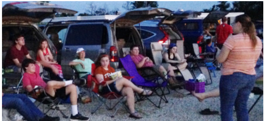
The Youth Group enjoyed movie night at the Mid-Way Drive-In Theatre on June 5.